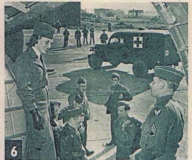
6 THEIR WORK completed temporarily, the nurse and the men relax for a second as the ambulance, loaded with wounded they evacuated, heads for the hospital.