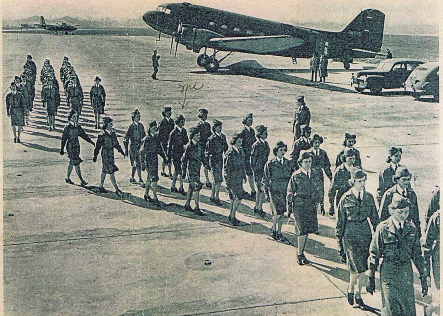
FOUR RIGOROUS WEEKS of training ended, gold second lieutenant bars are waiting up ahead for these nurses, the first official air evacuation group graduated at Bowman Field. All were told at graduation that they face immediate call for foreign duty. Each nurse going into the air wears flying togs, but her hospital uniform is the traditional white dress.

But whatever their motive, they're angels to the boys at the front.