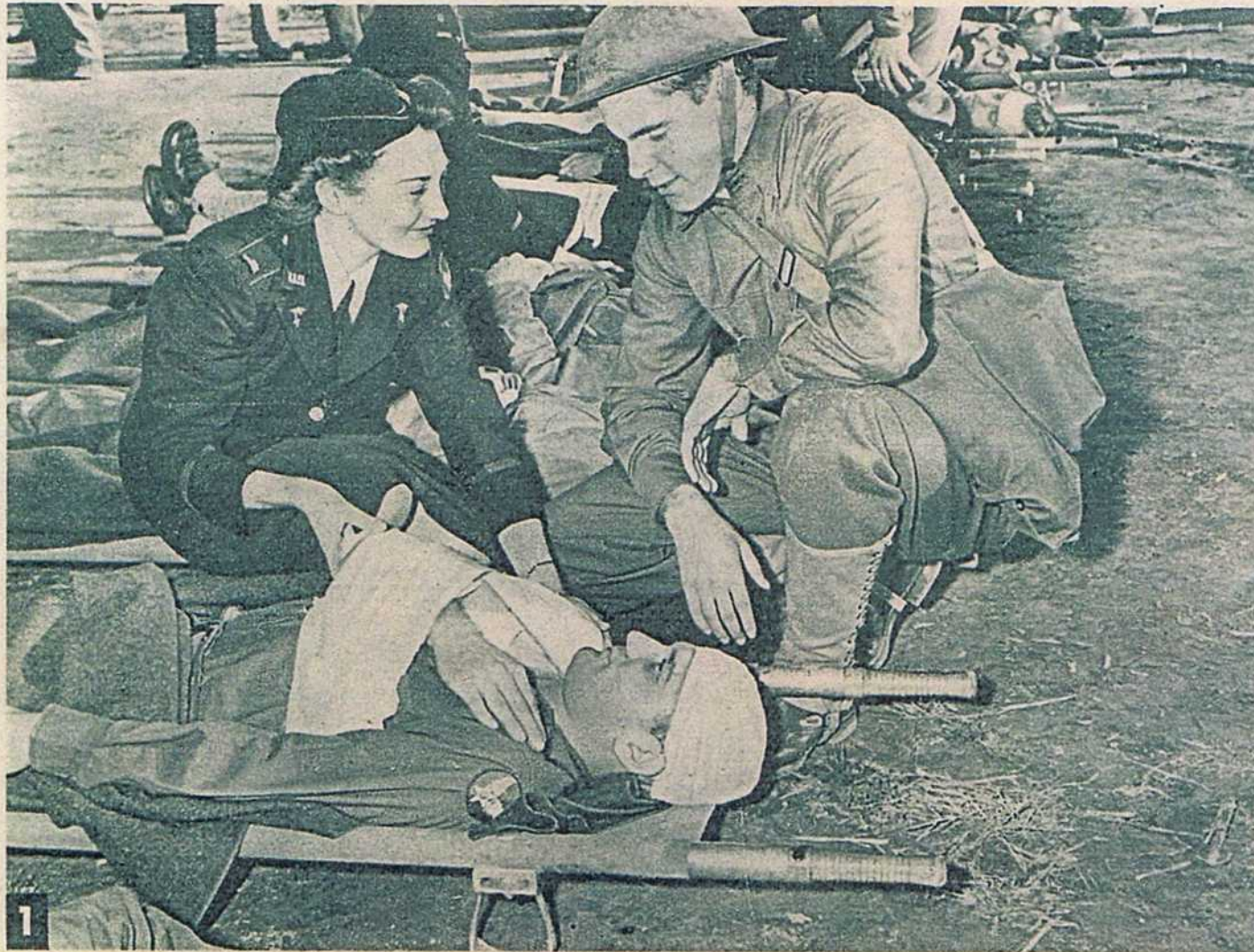
1 A NURSE from the School for Air Evacuation Nurses at Bowman Field goes to work under conditions similar to a battlefield. First she treats the wounded soldiers and selects those to be ferried back to a field hospital for immediate attention. In this series of pictures, Bowman Field represents the battlefield, Camp Aiterbury, Ind., the hospital.

AS THIS war rages on, wounded American soldiers up near the front lines of battlefields all over the world will be opening their eyes to a sight both pleasant and welcome, but which is just about the last thing they'd expect to see so near no-man's-land. They'll be seeing attractive nurses who sport the gold bars of Army Air Corps second lieutenants.