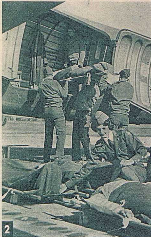
2 NEXT wounded soldiers are loaded into the transport at the Bowman Field front by enlisted men under the supervision of the nurse, a second lieutenant in rank.

Because being a flight nurse has glamor appeal, entrance into the school is difficult so as to keep out those who would enter purely through the love for adventure. A girl must be a registered nurse, under 38 years old, not over 5 feet