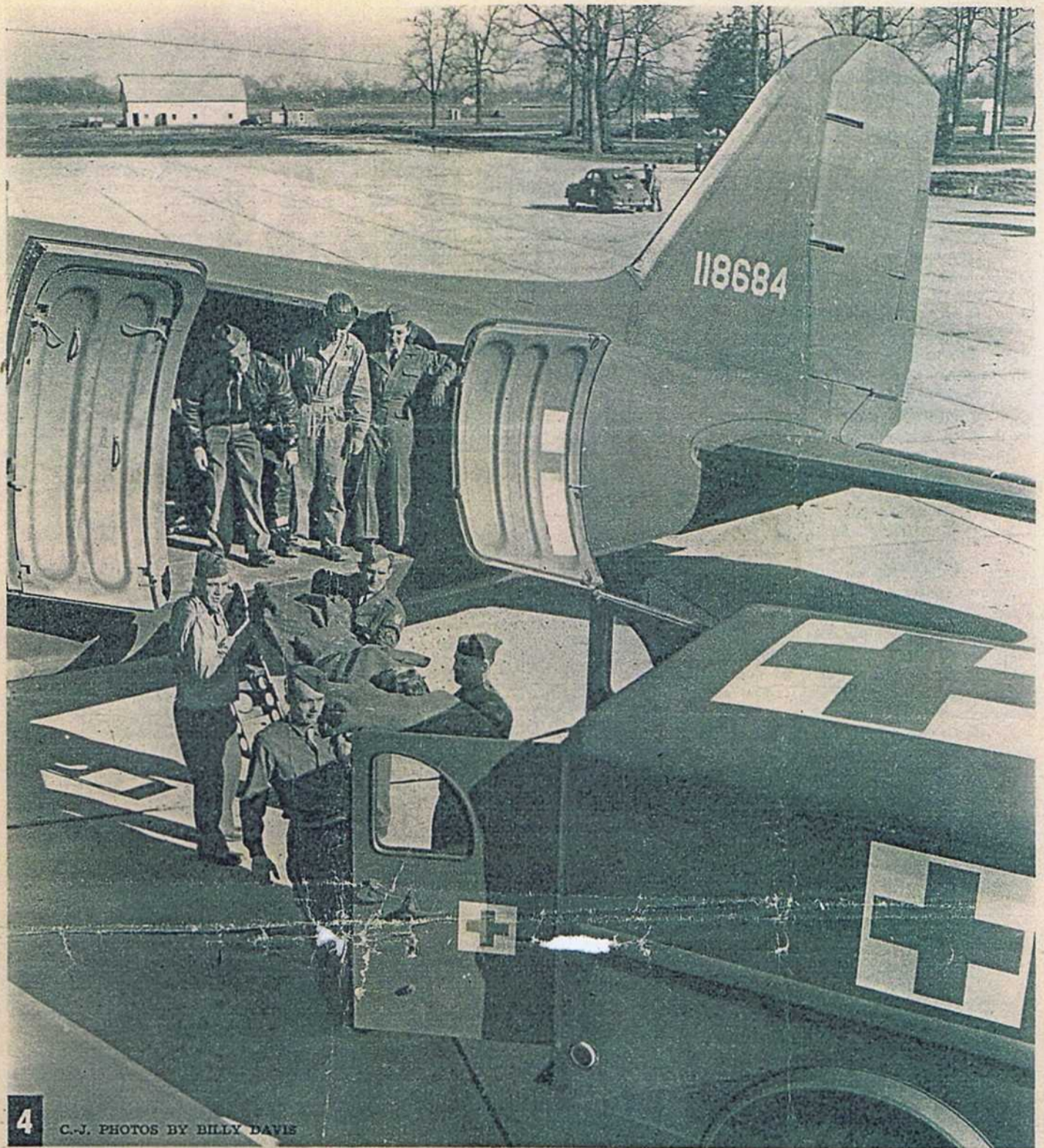
4 C.-J. PHOTOS BY BILLY DAVIS

The advantage of evacuation by air can best be told through simple figures. By road, the distance from Bowman Field to Camp Atterbury is approximately seventy-five miles, or even on highways not pocked by bomb bursts a journey by motor of at least an hour and a half. By air that distance can be covered, in fact, was covered on the